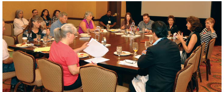
The new board gets down to business....

There was no other new business to be discussed so the meeting was adjourned.