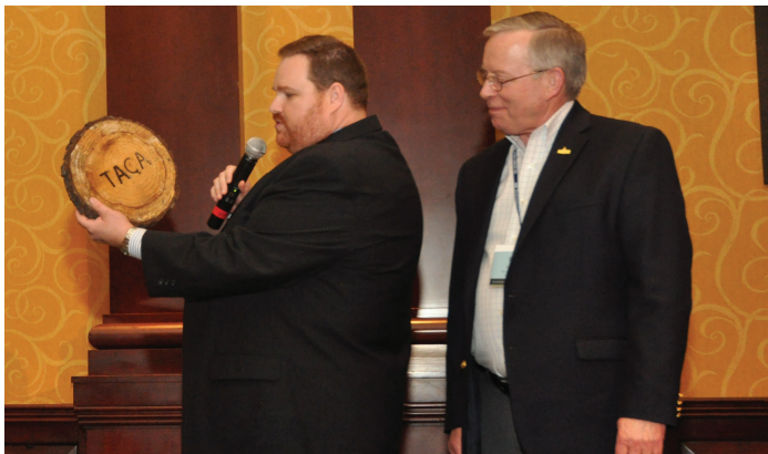
Presenting of the TACA Cowboy Frisbee