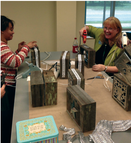
Putting on the final touches....you know it's serious when tools come out!