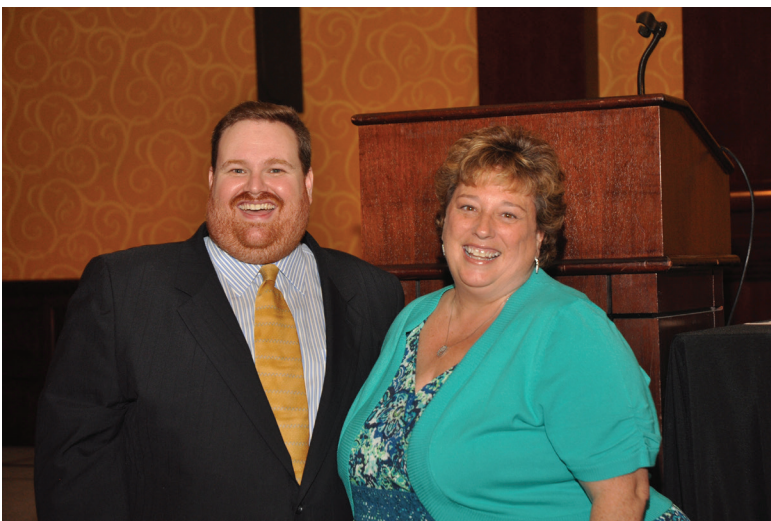
Mr. and Mrs. President