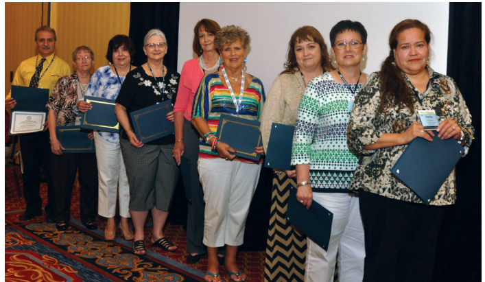
20 Year Certificates