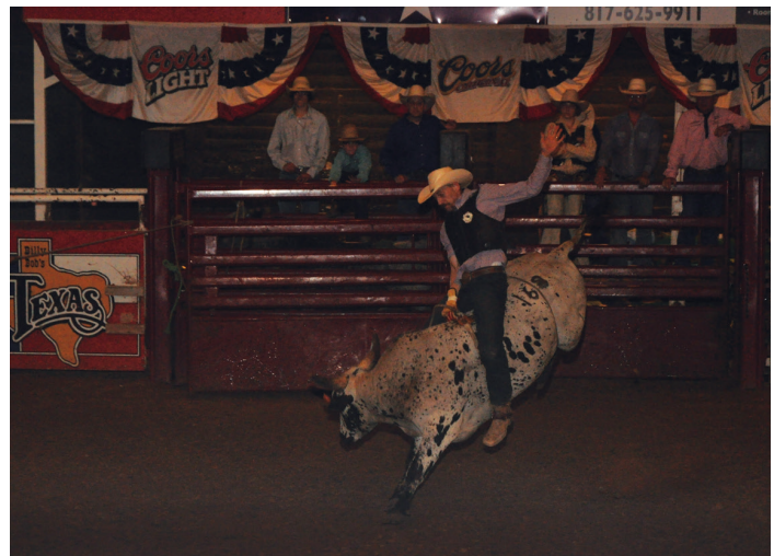
Ride 'Em Cowboy