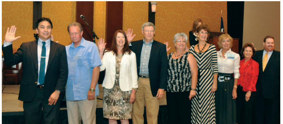
Swearing In 2014-2015 Board