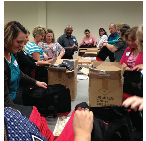
Stuffing the tote bags....what a great team effort!