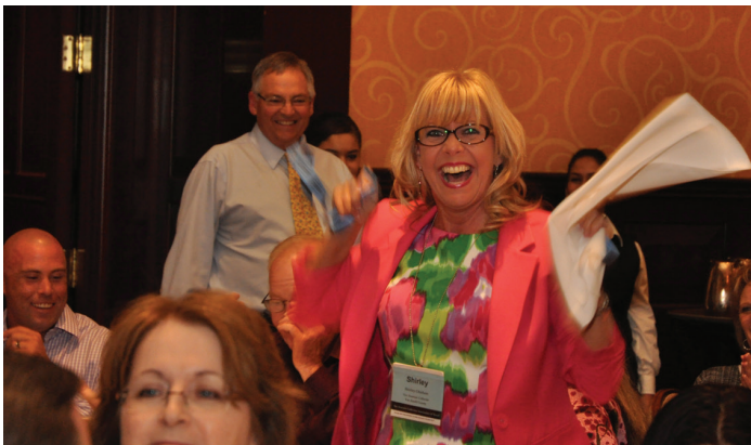
Happy - Happy - Happy