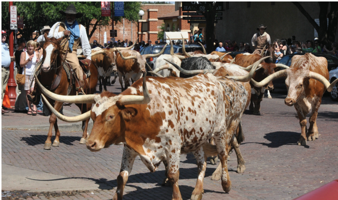
Longhorn Cattle Drive