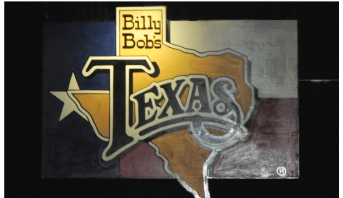
Billy Bob's Texas - Worlds Largest Honkeytonk