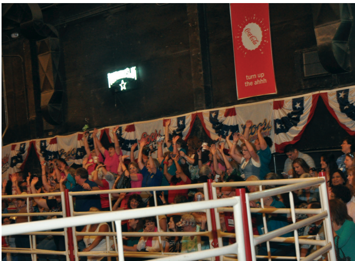
Rodeo Action A Crowd Pleaser